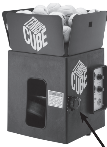
Ball Trajectory Knob

Loosen the ball trajectory knob by turning it a few turns counter-clockwise. Brace the machine with one hand and move the ball trajectory knob with your other hand. Move the knob up to increase the height of the ball throws. Move the knob down to decrease the height of the ball throws. When the ball throws are at the desired trajectory, tighten the knob firmly against the case by turning clockwise.